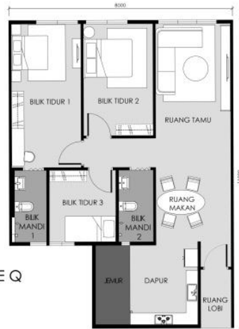
UNIT TYPE Q 850 kaki persegi