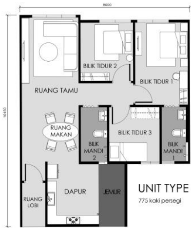
UNIT TYPE P 775 kaki persegi