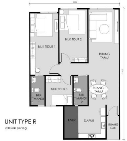
UNIT TYPE R 900 kaki persegi